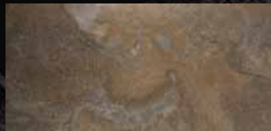
Black 13" x 24"