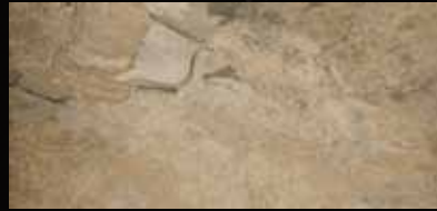
Sand 13" x 24"