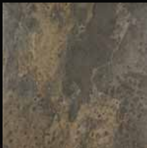
Black 13" x 13"