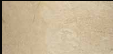
Bone 13" x 24"