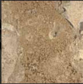
Sand 13" x 13"