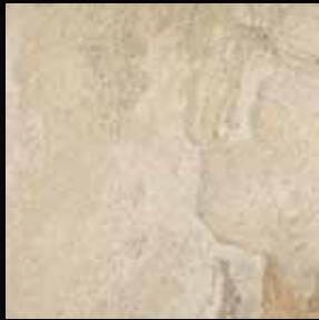
Bone 13" x 13"