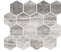
SILVER 26x29cm / 10.25"x11.75" 3"x3" HEXAGONAL MOSAIC MATTE