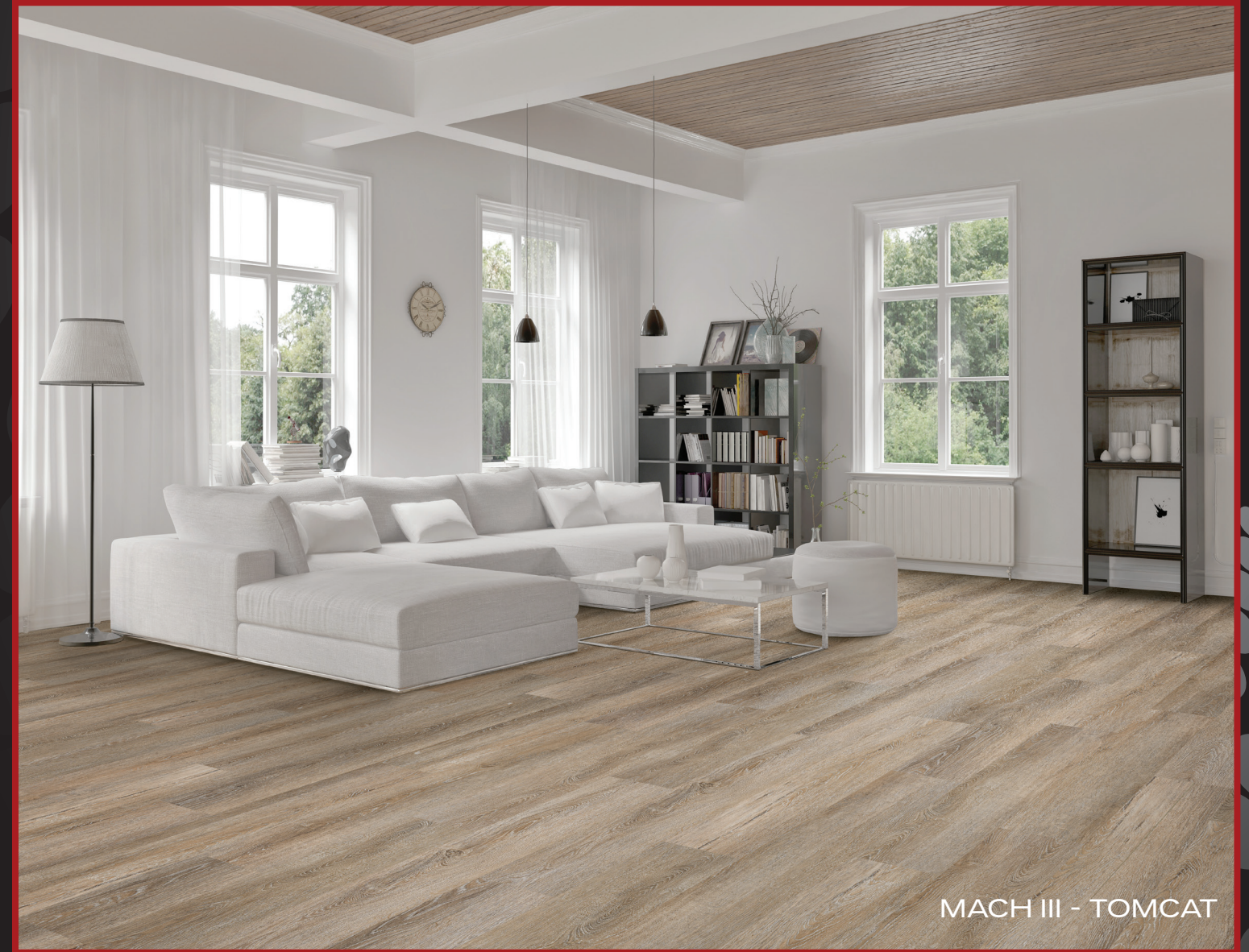
MACH III - TOMCAT