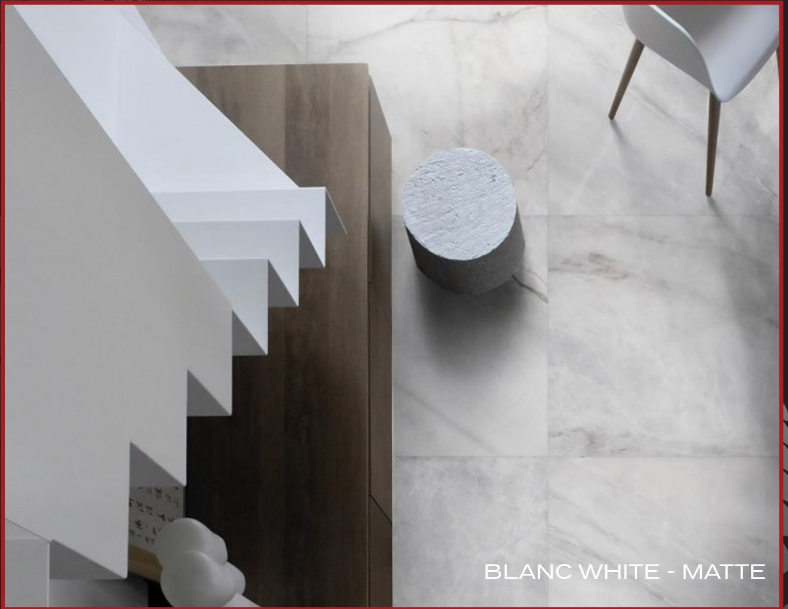
BLANC WHITE - MATTE