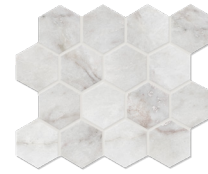
WHITE 26x29cm / 10.25"x11.75" 3"x3" HEXAGONAL MOSAIC MATTE