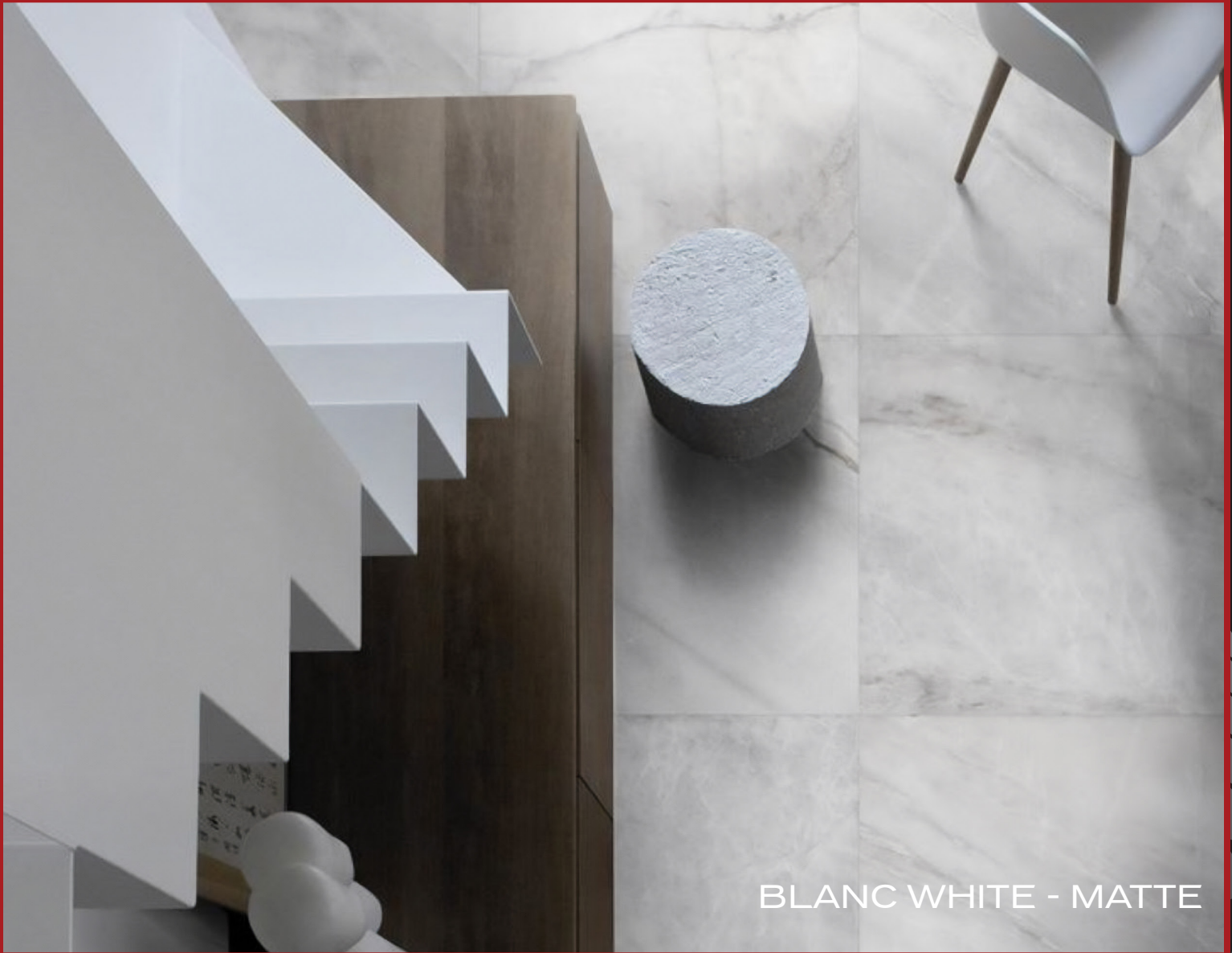
BLANC WHITE - MATTE