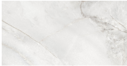
WHITE 40x80cm / 16"x32" MATTE / POLISHED