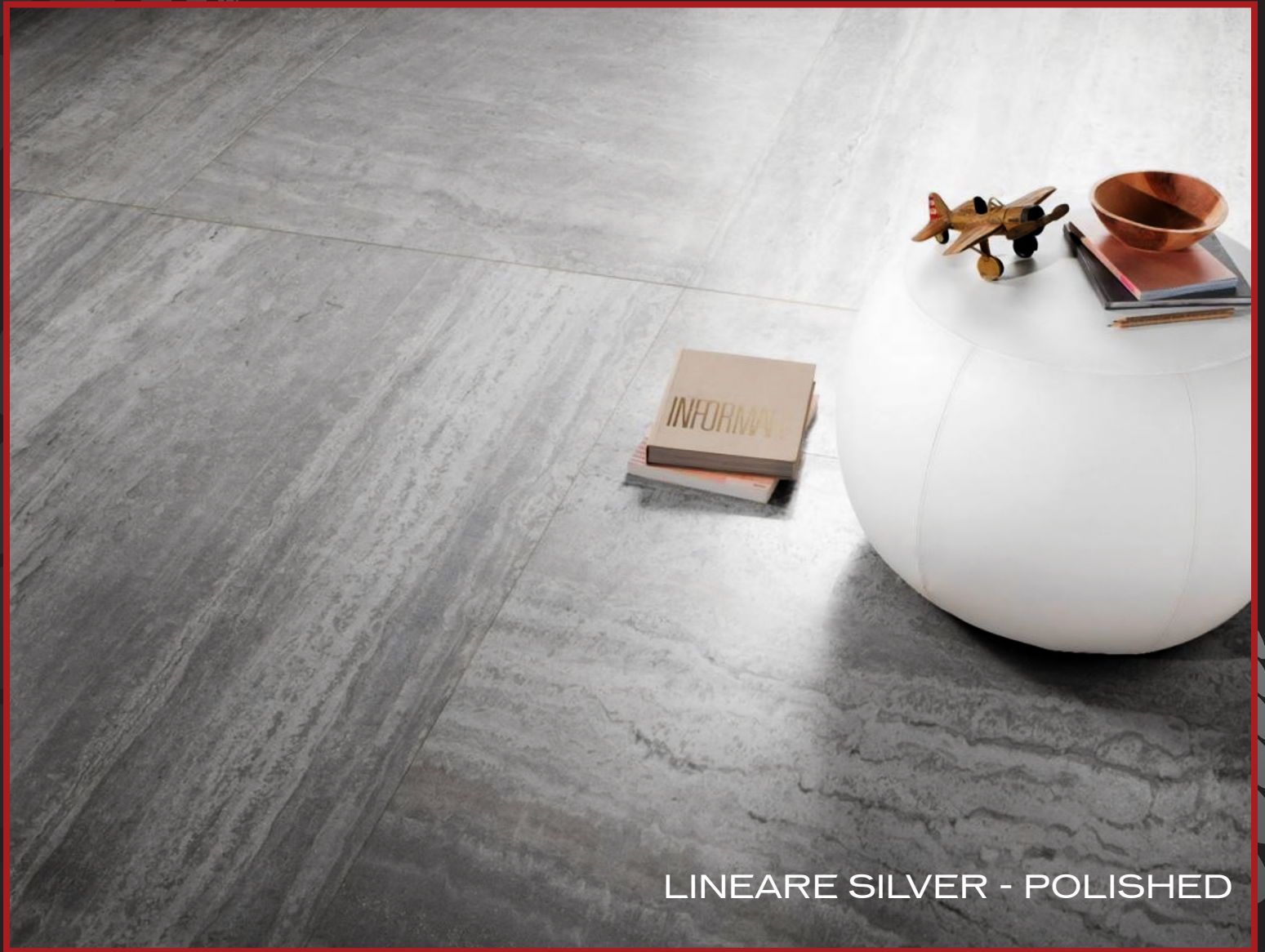
LINEARE SILVER - POLISHED