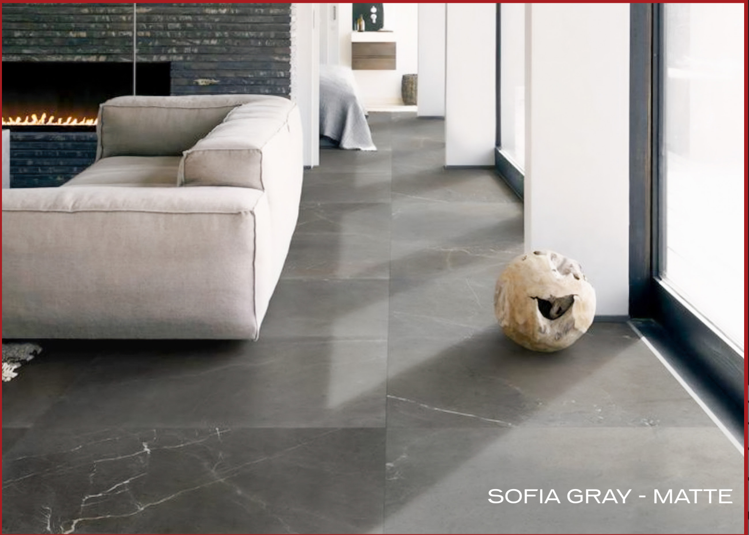
SOFIA GRAY - MATTE