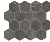
GRAY 26x29cm / 10.25"x11.75" 3"x3" HEXAGONAL MOSAIC MATTE