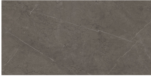
GRAY 40x80cm / 16"x32" MATTE / POLISHED