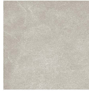
GRAY PLUS 30x30cm / 12"x12" MATTE