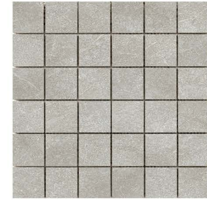
GRAY PLUS 2"x2" MOSAIC 30x30cm / 12"x12" SHEET MATTE