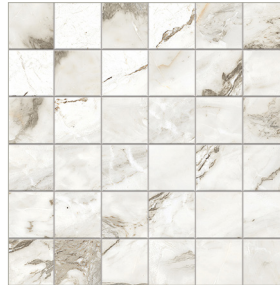
CREMA 2"x2" MOSAIC 30x30cm / 12"x12" SHEET MATTE