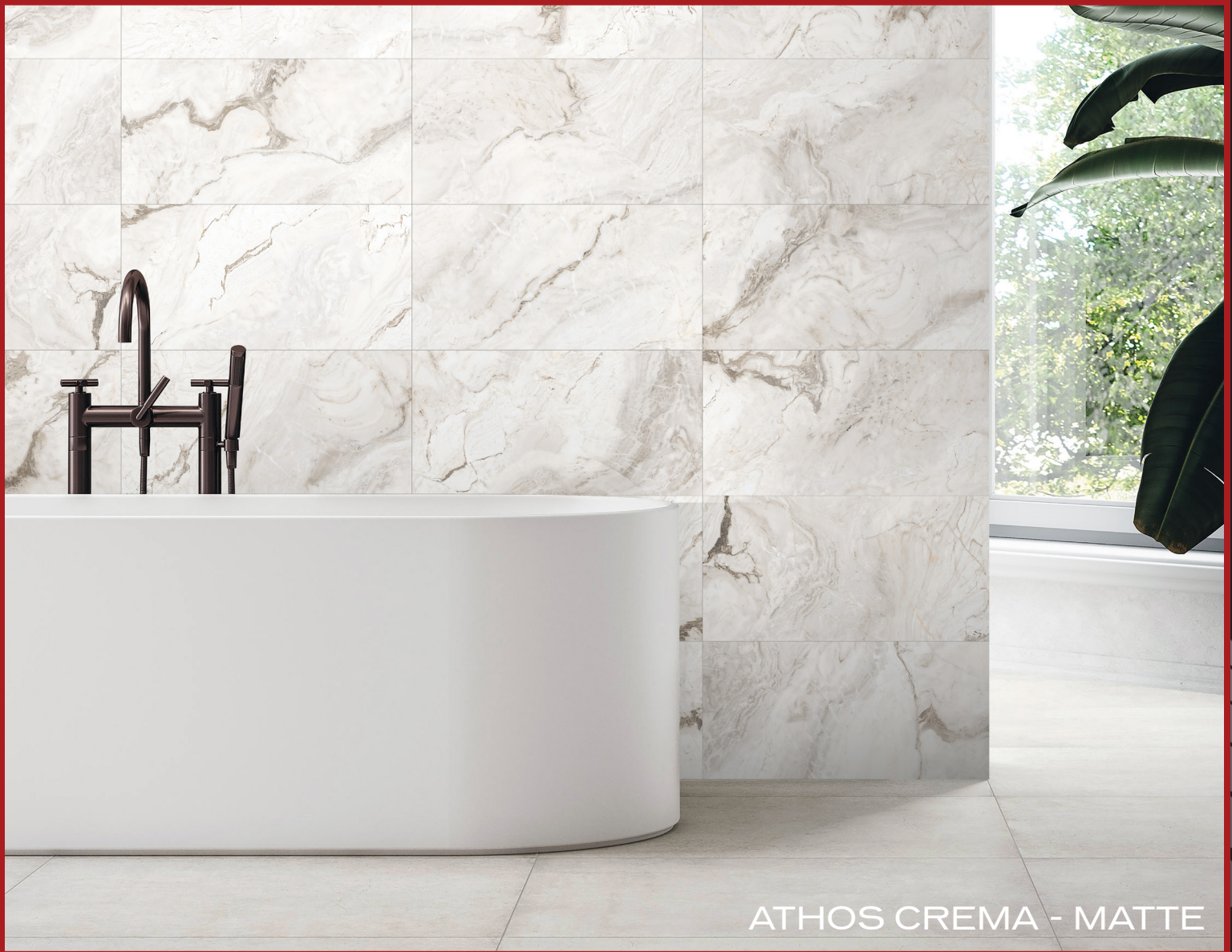
ATHOS CREMA - MATTE