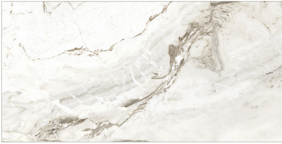
CREMA 30x60cm / 12"x24" MATTE / POLISHED