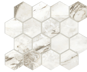
CREMA 26x29cm / 10.25"x11.75" 3"x3" HEXAGONAL MOSAIC MATTE