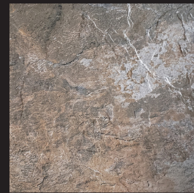
PEBBLE 45x45cm / 18"x18"