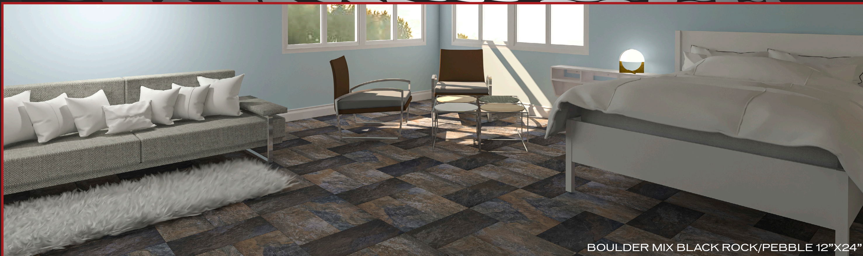
BOULDER MIX BLACK ROCK/PEBBLE 12"x24"