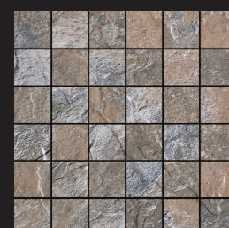
PEBBLE 2"x2" MOSAIC 30x30cm / 12"x12"