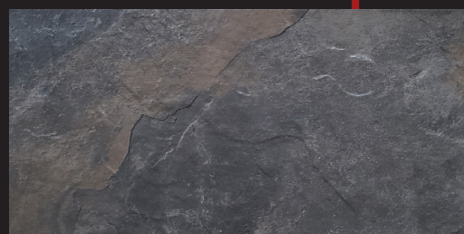
BOULDER BLACK ROCK 30x60cm / 12"x24"