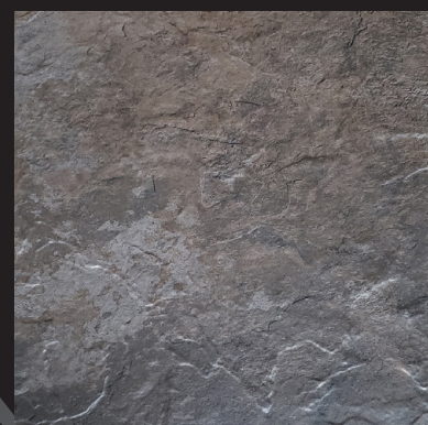
BLACK ROCK 45x45cm / 18"x18"