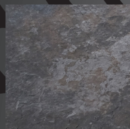
BLACK ROCK 30x30cm / 12"x12"