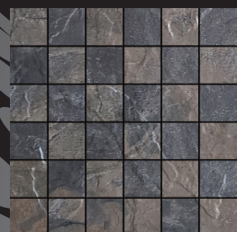
BLACK ROCK 2"x2" MOSAIC 30x30cm / 12"x12"