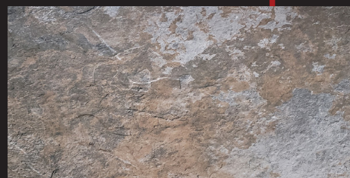
BOULDER PEBBLE 30x60cm / 12"x24"