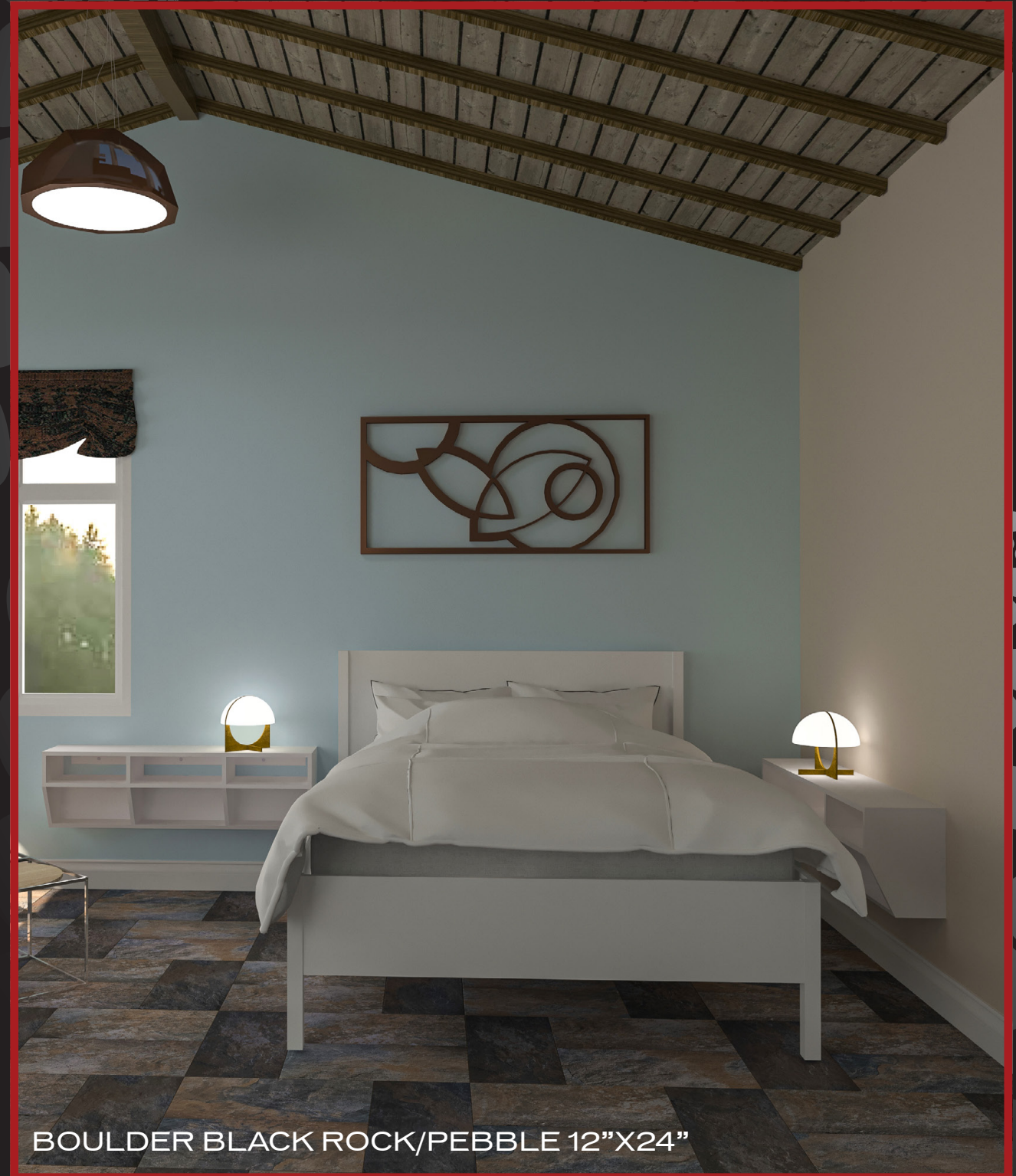
BOULDER BLACK ROCK/PEBBLE 12"X24"