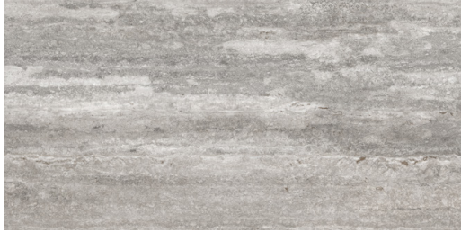
SILVER 40x80cm / 16"x32" MATTE / POLISHED