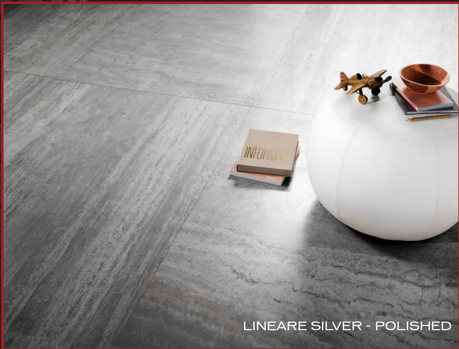
LINEARE SILVER - POLISHED