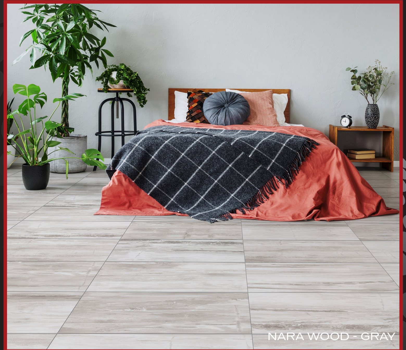
NARA WOOD - GRAY