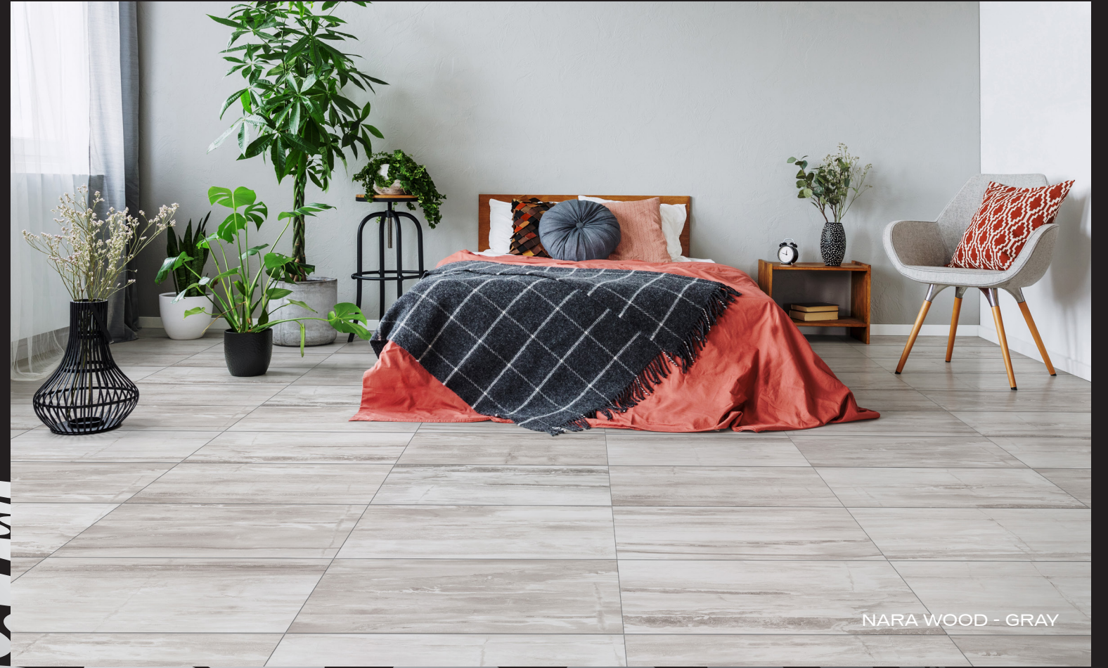
NARA WOOD - GRAY