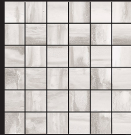
GRAY 30x30cm / 11.75"x11.75" 2"x2" MOSAIC MATTE