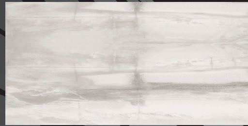
GRAY 30x60cm / 12"x24" MATTE/POLISHED