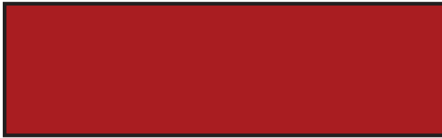
RESSORT ASH 22.5x75cm / 9"x30"