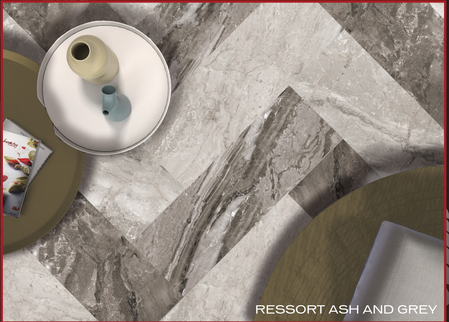
RESSORT ASH AND GREY