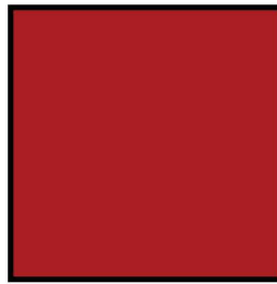
30x30cm / 12"x12"