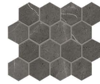
GRAY 26x29cm / 10.25"x11.75" 3"x3" HEXAGONAL MOSAIC MATTE