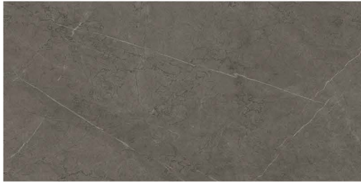
GRAY 40x80cm / 16"x32" MATTE / POLISHED