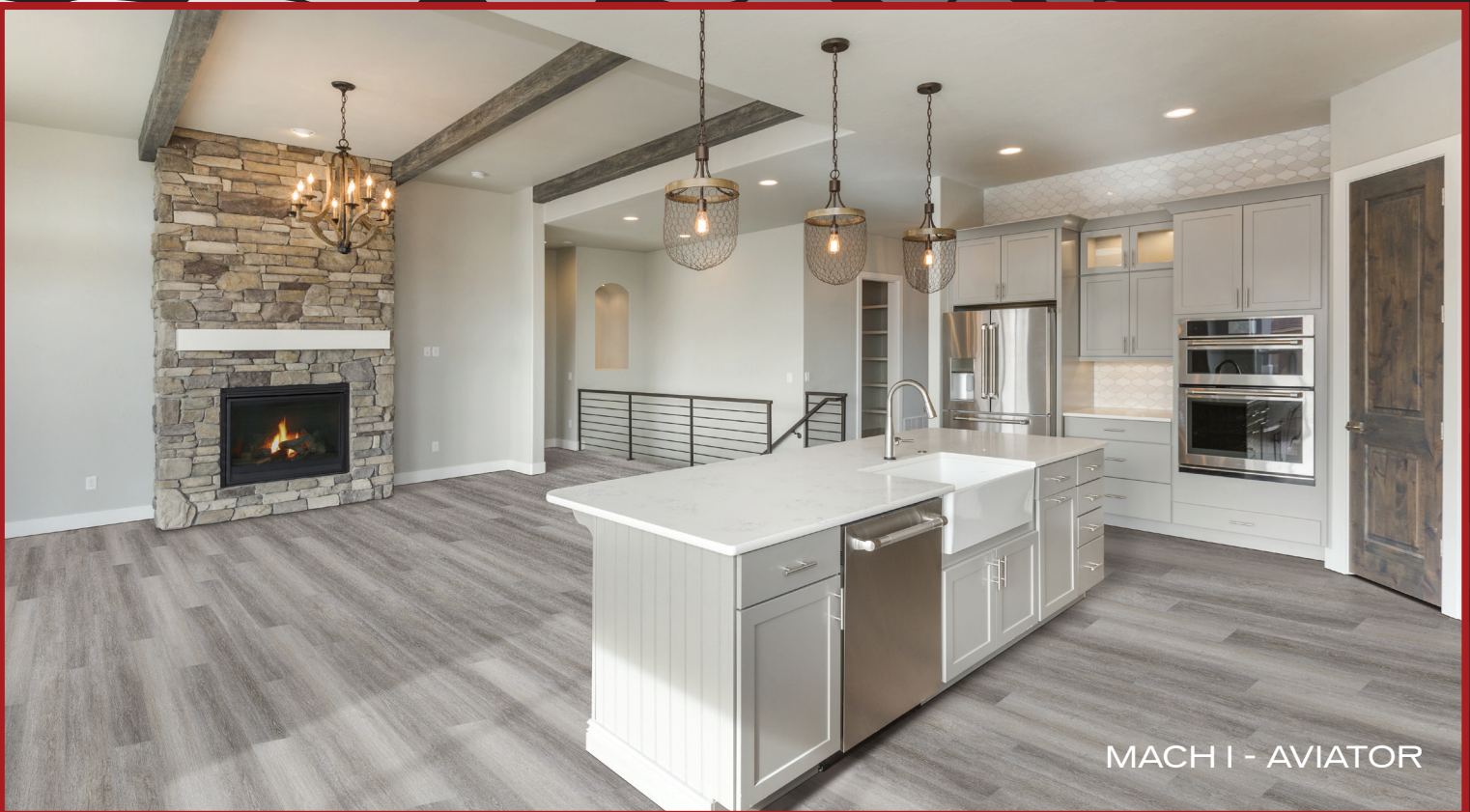
MACH I - AVIATOR