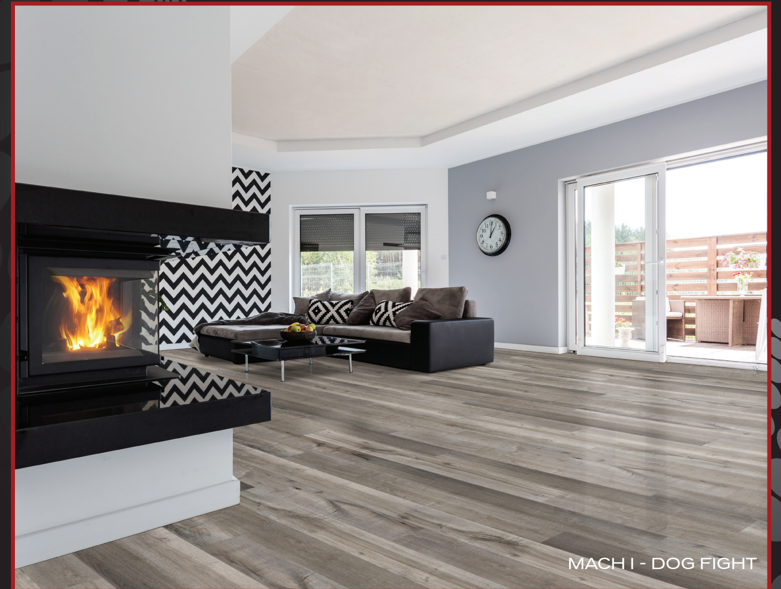
MACH I - DOG FIGHT