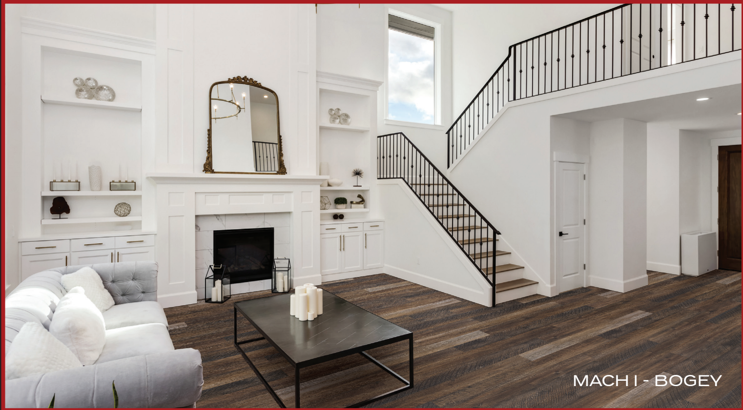
MACH I - BOGEY