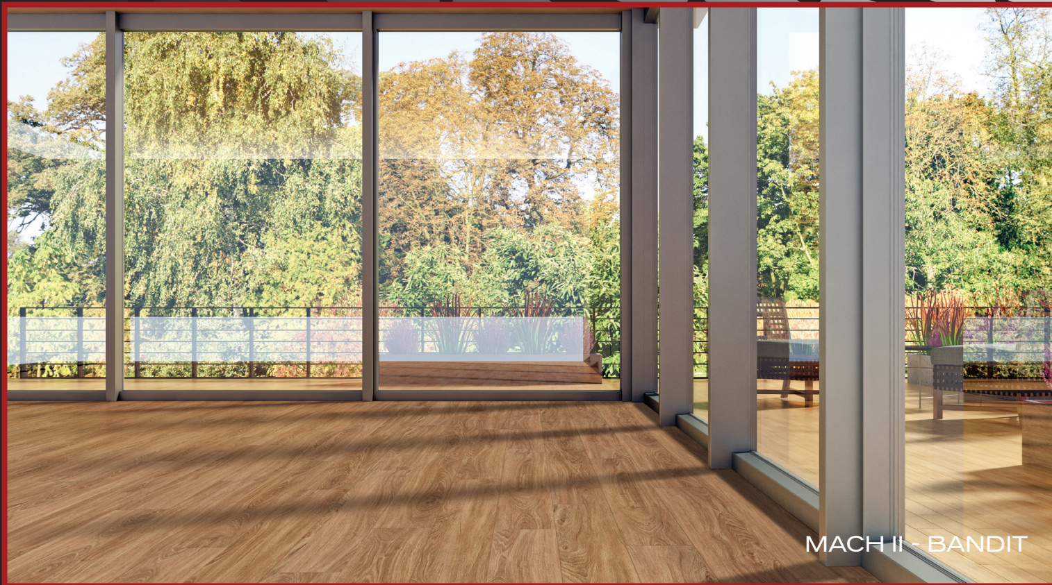
MACH II - BANDIT