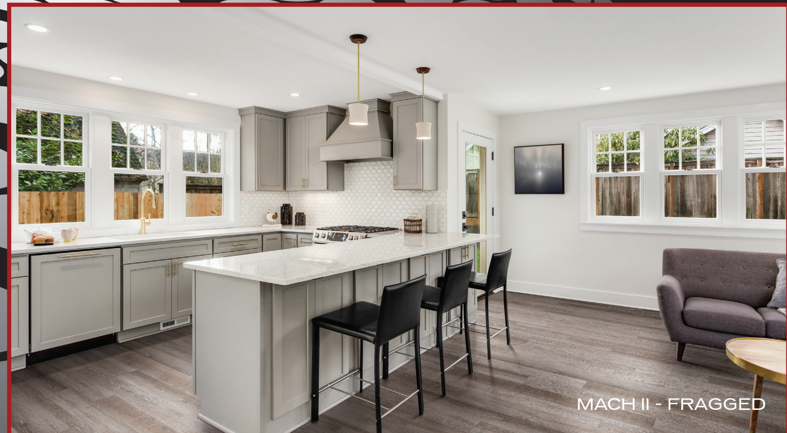
MACH II - FRAGGED