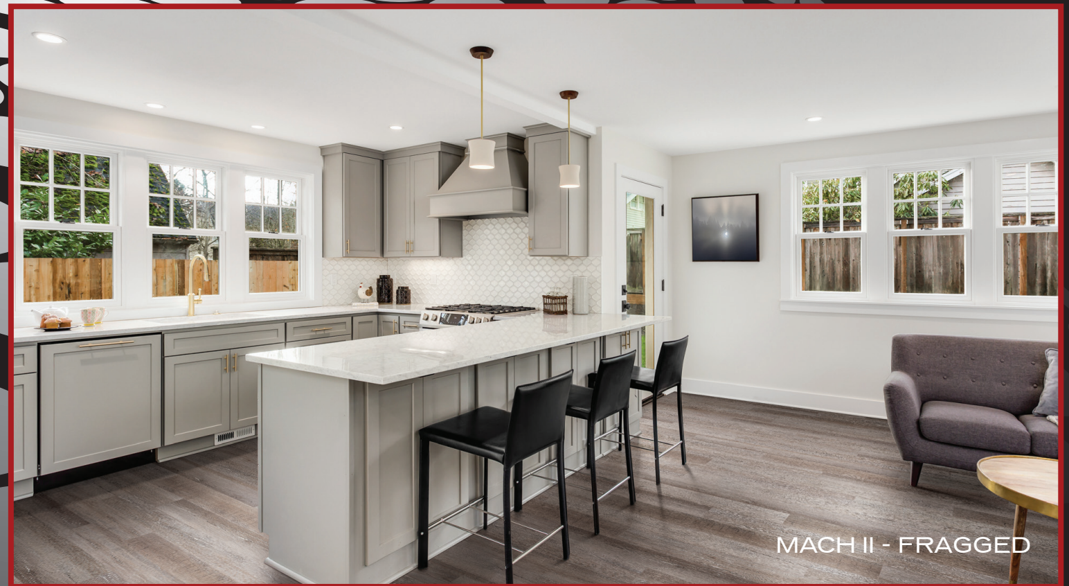
MACH II - FRAGGED