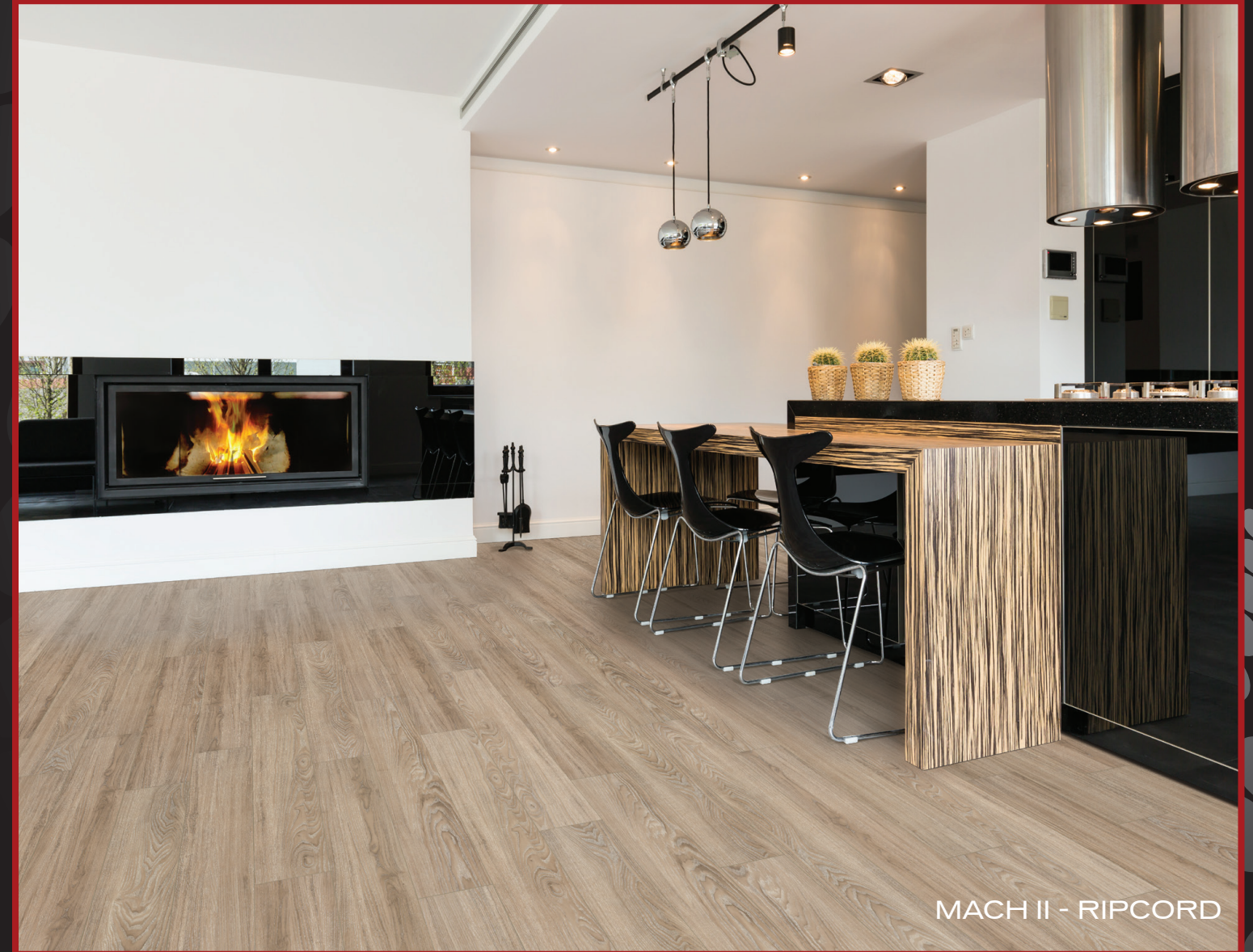
MACH II - RIPCORD