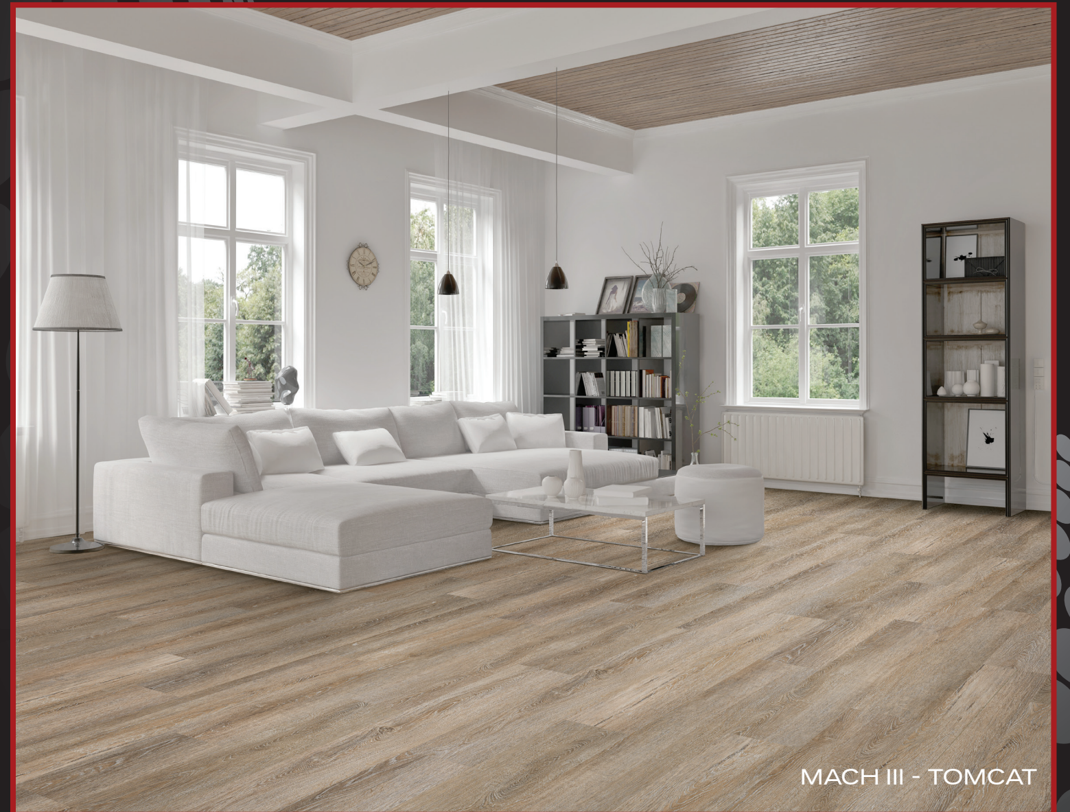
MACH III - TOMCAT