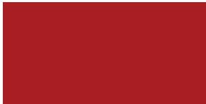
30x60cm / 12"x24" MATTE / POLISHED