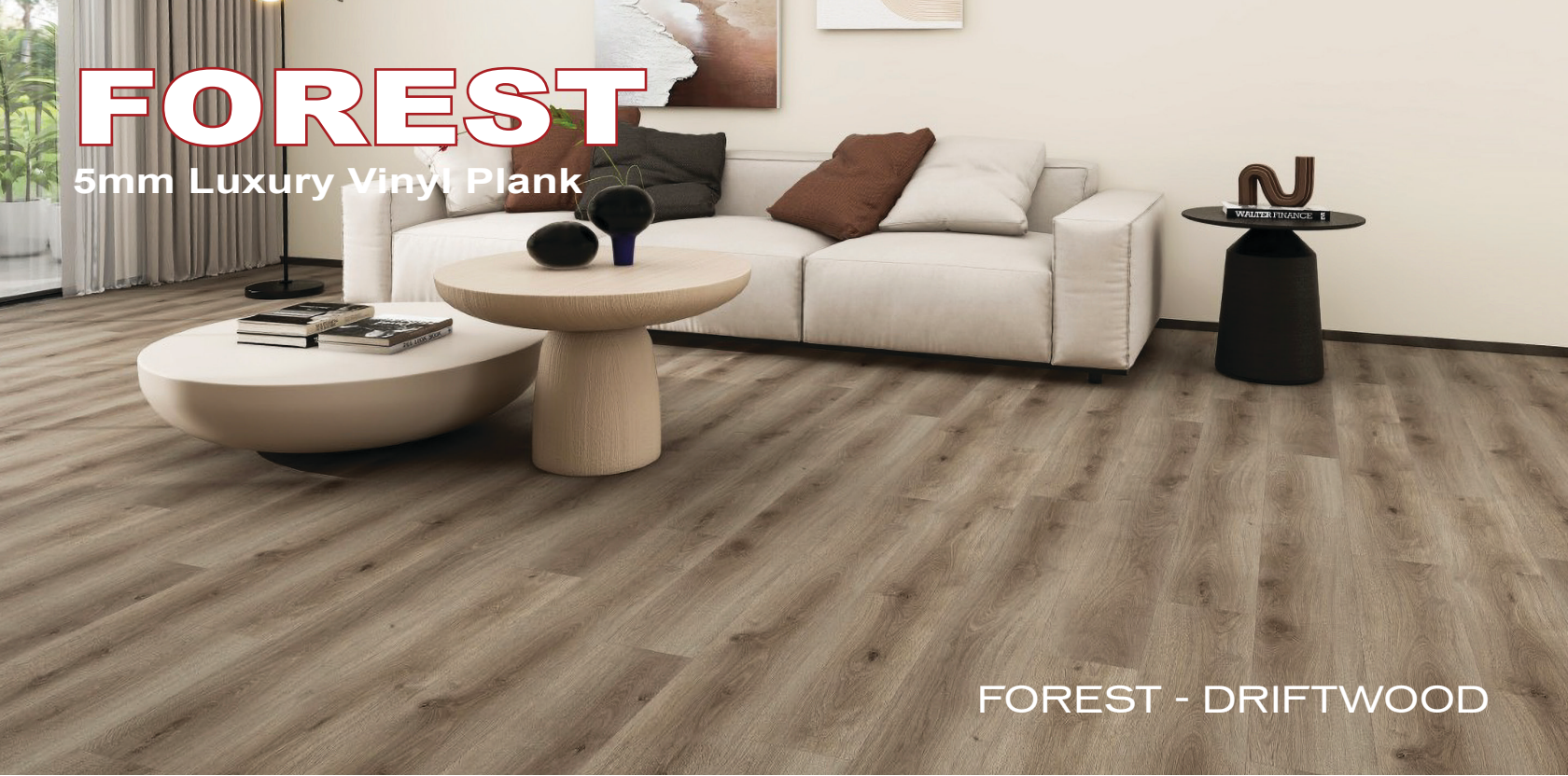
FOREST - DRIFTWOOD