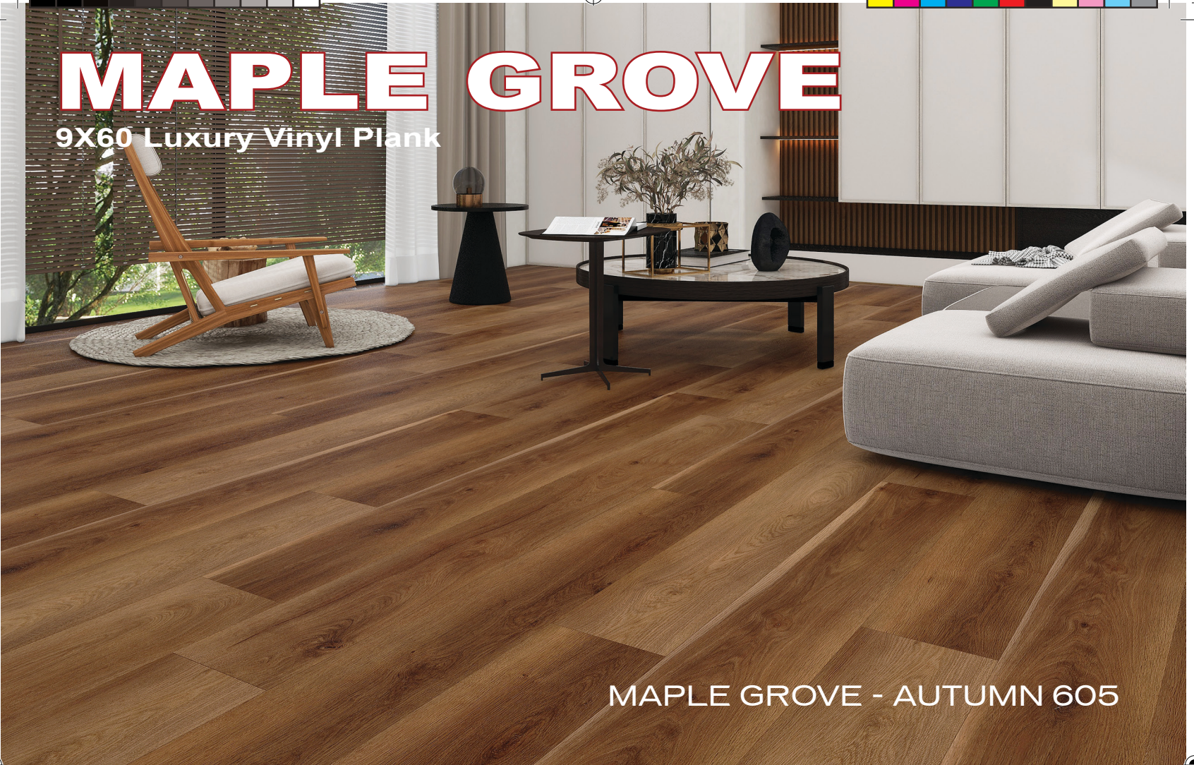
MAPLE GROVE - AUTUMN 605