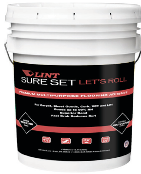
LINT SURE SET Multipurpose Flooring Adhesive 4 Gallons (#LTA-SS4) 1 Gallon (#LTA-SS1)