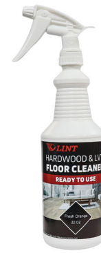
Ready-to-Use Lint Hardwood & LVT Floor Cleaner (#LTC-WL)