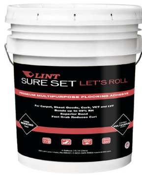
LINT SURE SET Multipurpose Flooring Adhesive 4 Gallons (#LTA-SS4) 1 Gallon (#LTA-SS1)