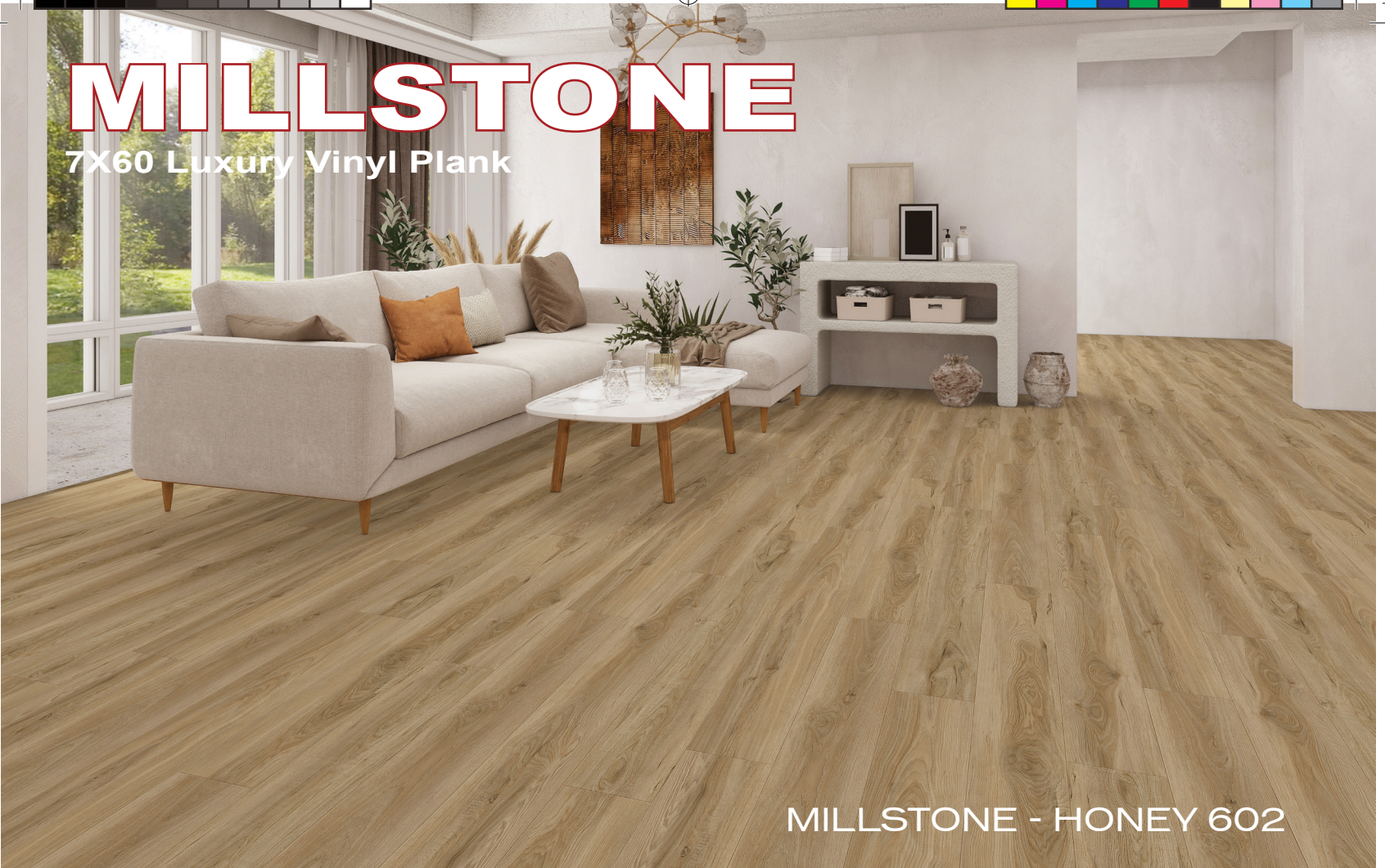
MILLSTONE - HONEY 602