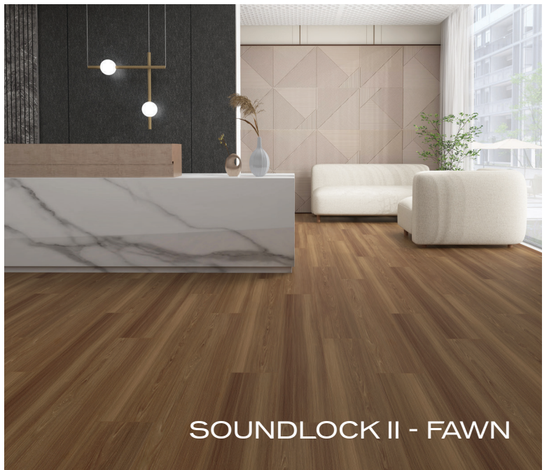
SOUNDLOCK II - FAWN

FAWN 17.5x120cm / 7"x48" 20mil Wear Layer #NS-SL2 7X48-FA