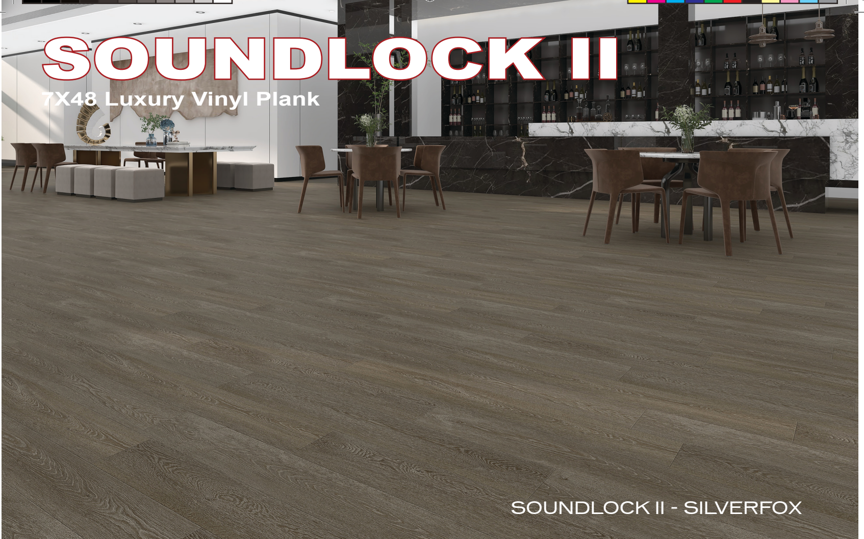
SOUNDLOCK II - SILVERFOX