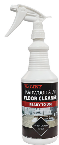
Ready-to-Use Lint Hardwood & LVT Floor Cleaner (#LTC-WL)