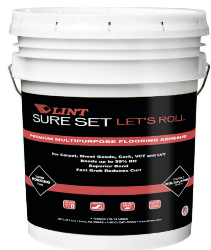
LINT SURE SET Multipurpose Flooring Adhesive 4 Gallons (#LTA-SS4) 1 Gallon (#LTA-SS1)

LUXE PRO Brownstone Brownstone 17.5x120cm / 7"x48" 12mil Wear Layer # NS-LP 7X48-BS