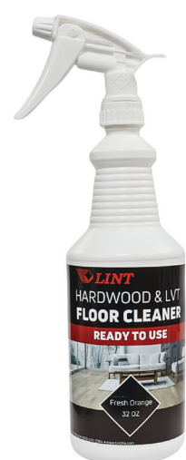
Ready-to-Use Lint Hardwood & LVT Floor Cleaner (#LTC-WL)