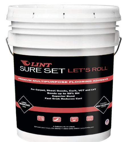
LINT SURE SET Multipurpose Flooring Adhesive 4 Gallons (#LTA-SS4) 1 Gallon (#LTA-SS1)