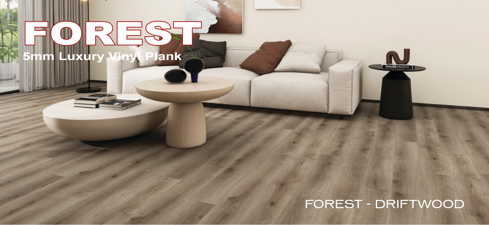
FOREST - DRIFTWOOD